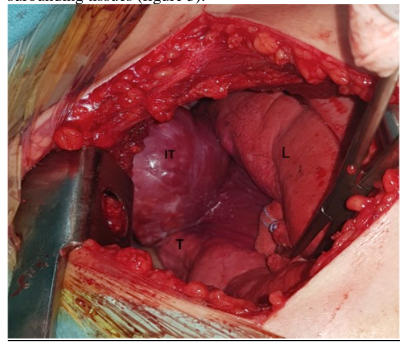
Figure 3 : Per-opératoiry view L : Lung T : Trachea IT : Inflammatory tumor

The resort to surgery was for diagnostic and therapeutic purposes. The patient underwent a right thoracotomy. During the operation it was found that the tumor located in the Barety lodge, encapsuled and firmly adherent to surounding tissues (figure 3).