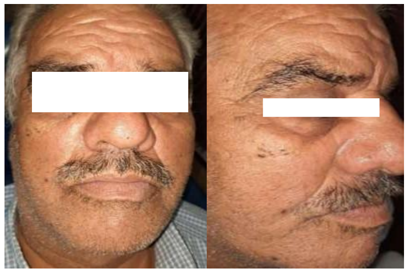
Fig 6 (a,b) : Front and profile extraoral view after 4 month following-up