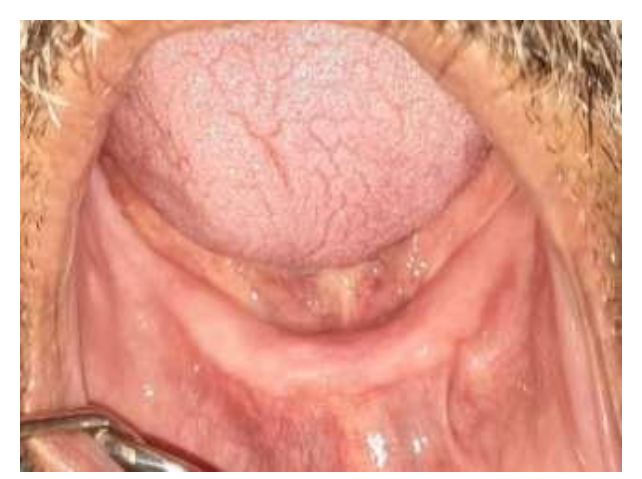
Fig 7 : Intraoral view of mandible after 4 month following-up.