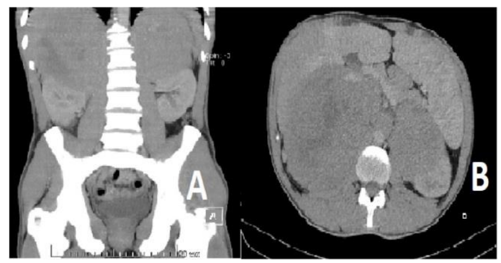
Figure 1: CT scan of the abdomen and pelvis revealing bilateral adrenal masses with necrosis and regular contours. A: axial image. B: coronal image.

As surgery is not recommended in these patients, we referred the patient to an oncologist for further chemotherapy and follow-up.