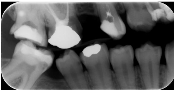
Bite-Wing Radiograph Showing the Erupted 4 Premolars