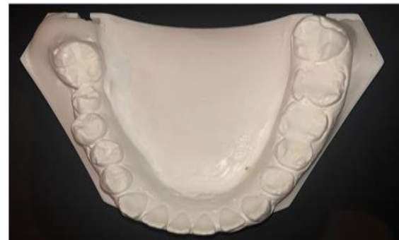
Occlusal View of Diagnostic Cast – Mandibular Arch