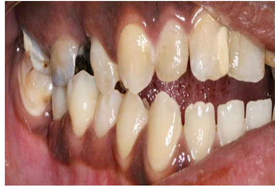
Lateral view – Mandibular Right Side