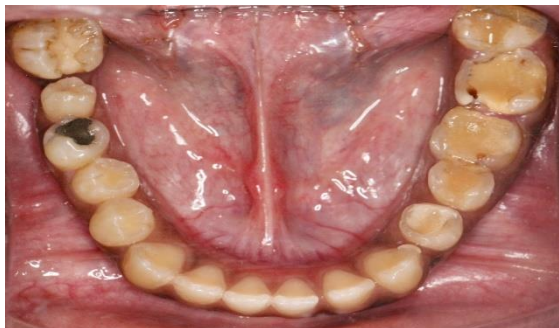
Clinical Occlusal View – Mandibular Arch